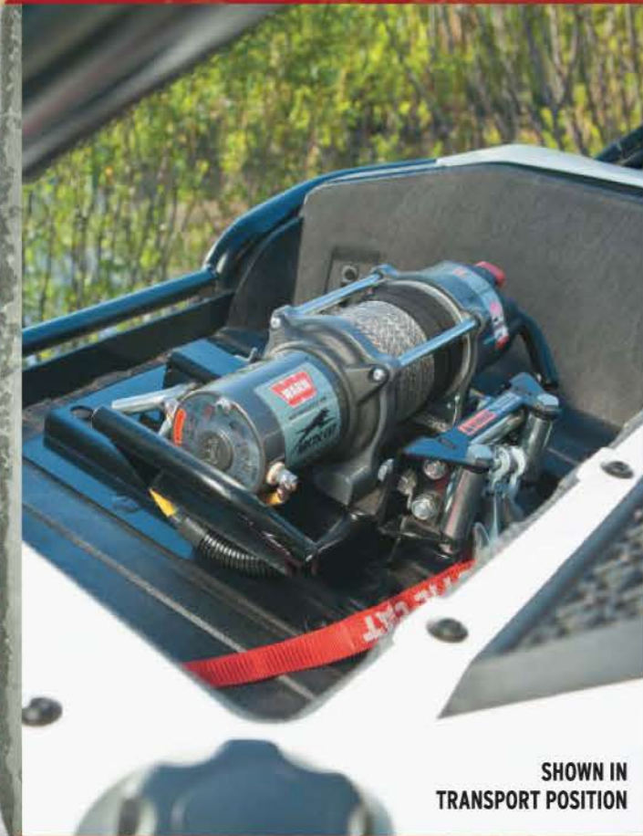
SHOWN IN TRANSPORT POSITION