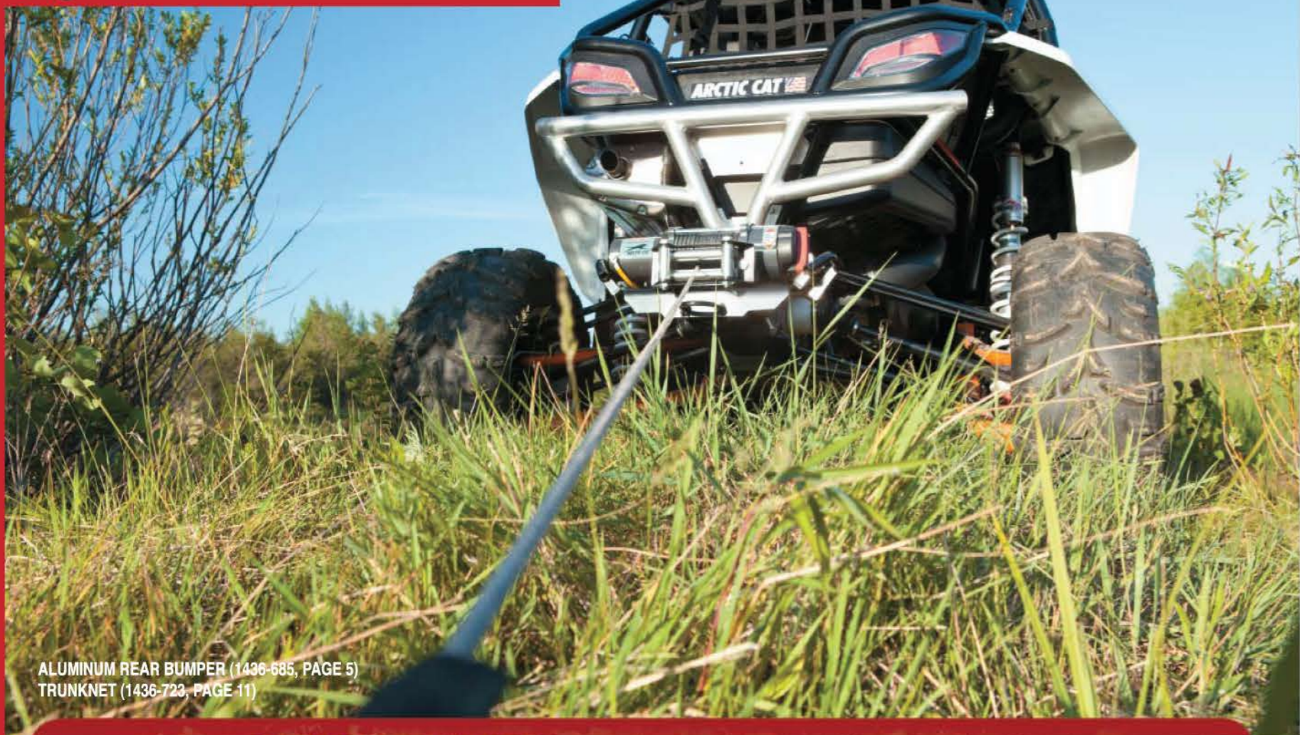
ALUMINUM REAR BUMPER (1436-685, PAGE 5) TRUNKNET (1436-722, PAGE 11)