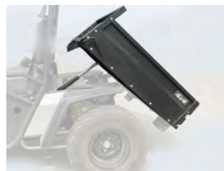
Electric Bed Lift PN: 18838-R