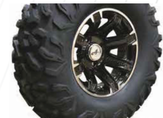
Wheels/ Rims (Blk Aluminum, Red Aluminum, All-Terrain DOT Tires, Commercial DOT Tires) PN: 17288-R (Shown)

Browse All Accessory Options Online: AmericanLandmaster.com/2021-Accessories