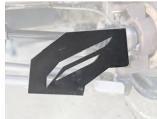
CV Guards PN: 18975-R