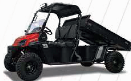
XL CONVERTIBLE STEEL BED / FLAT BED