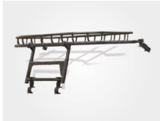
Front Hood Rack PN: 16829-R