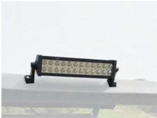
Front LED PN: 18921-R