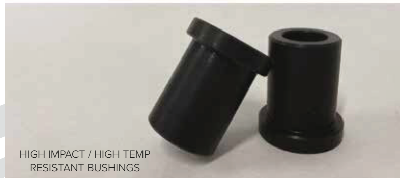
HIGH IMPACT / HIGH TEMP RESISTANT BUSHINGS