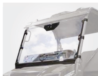
Single Piece Windshield PN: 19006-R