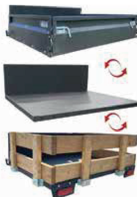
CONVERTIBLE STEEL BED / FLAT BED

Not available for the L7 & L7x or any models over 24mph.