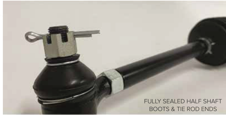
FULLY SEALED HALF SHAFT BOOTS & TIE ROD ENDS

No need to worry about dirt, debris or sticks stopping your ride experience.