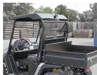
Work & Ride Light Pack (front LED bar, rear flood light, dome) PN: 18925-R