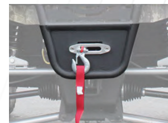
2,500 Lbs. Nylon Rope Winch PN: 18931-R