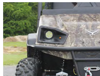
Street Light & Horn Pack (turn signals, horn, backup alarm, tail lights, license plate holder & light.) PN: 18923-R