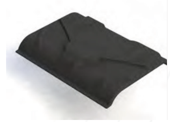
Plastic Roof PN: 19063-R