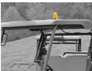
Commercial Signal Pack (backup alarm, strobe, horn) PN: 18927-R