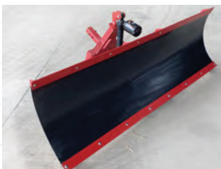
Dual Actuated Plow PN: 18850-R (60" Dual Actuated)