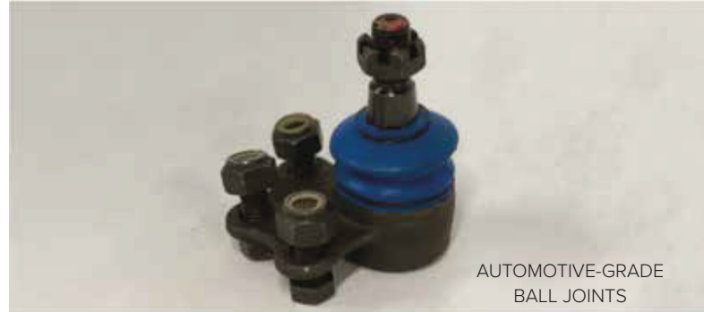
AUTOMOTIVE-GRADE BALL JOINTS