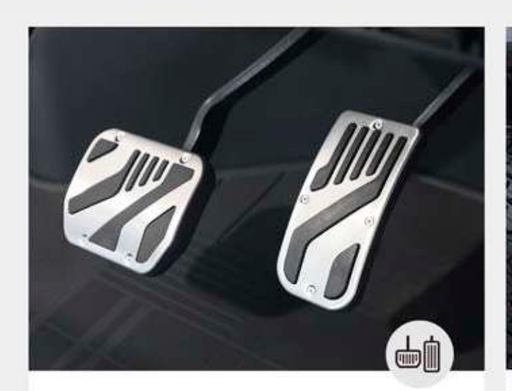
ACC Ergono control

SIDE MIRRORS WITH TURNING SIGNALS Enhance driving safety with mirrors that offer a clear rear view and integrated turn signals for easier lane changes, parking, and turns.