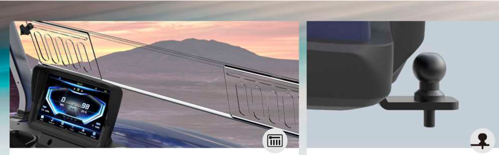
SLIDI Optimiz designe

Enhance accessibility and stability with grab handles on both driver and passenger sides for easy entry and exit.